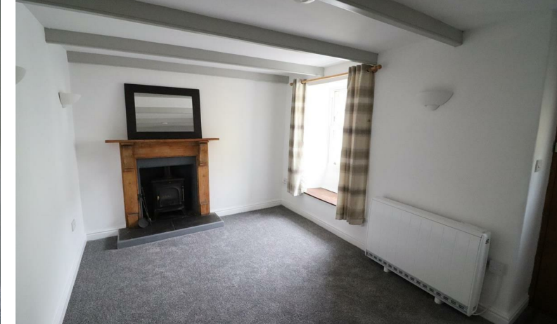
CHAPEL STREET, PROBUS £750 PCM