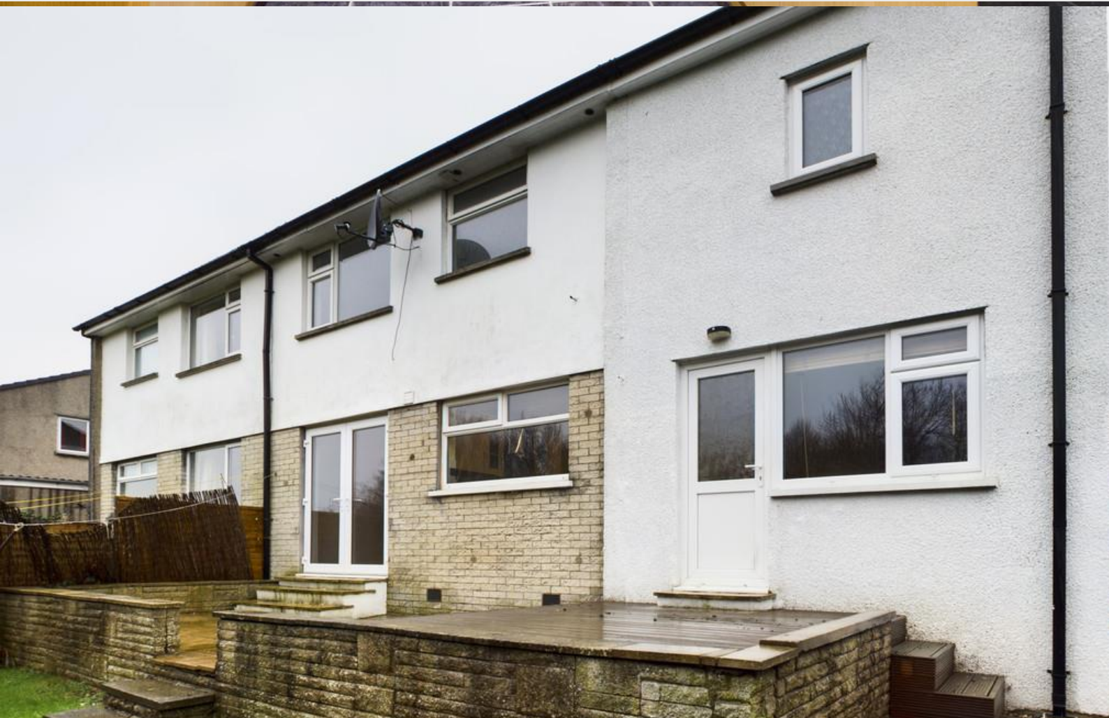
Rear of Property and Garden