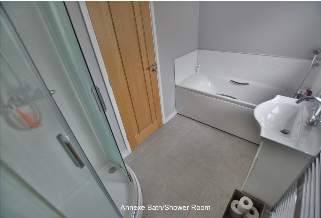
Annexe Bath/Shower Room