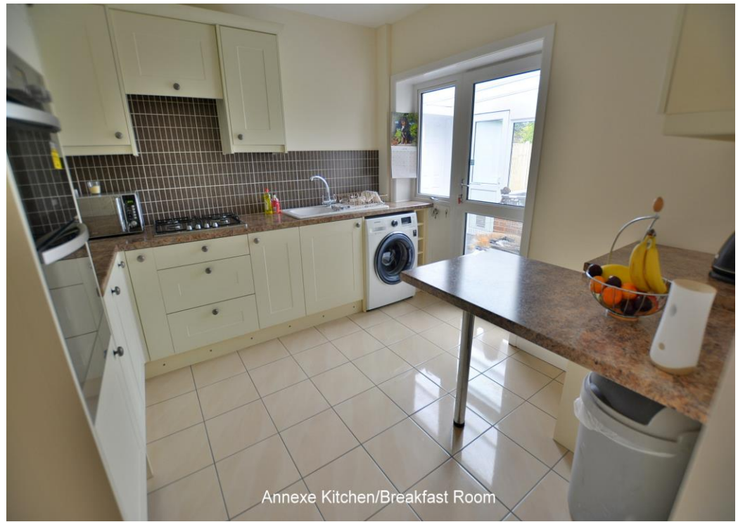
Annexe Kitchen/Breakfast Room