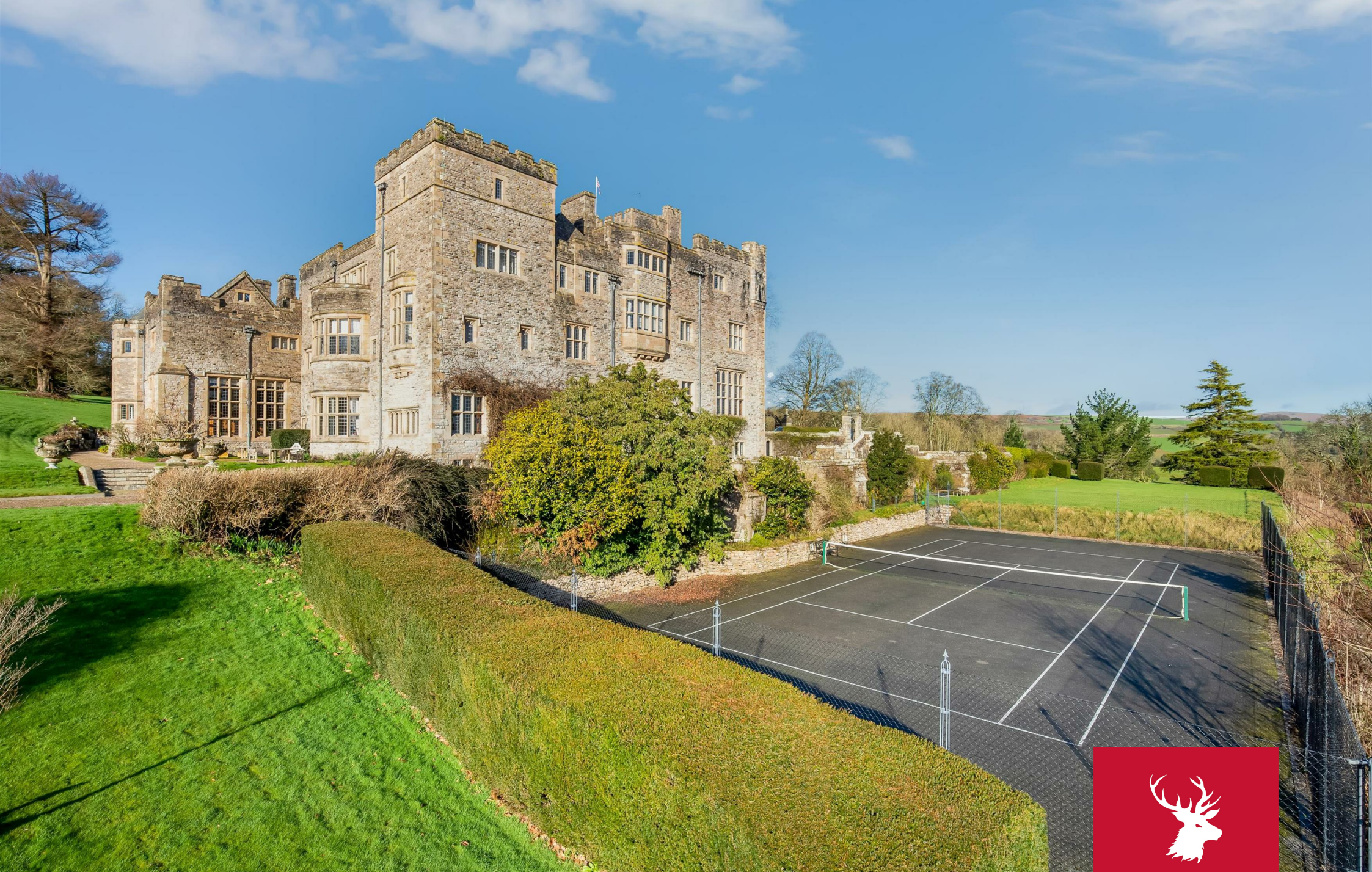
Apartment 10 Flete House