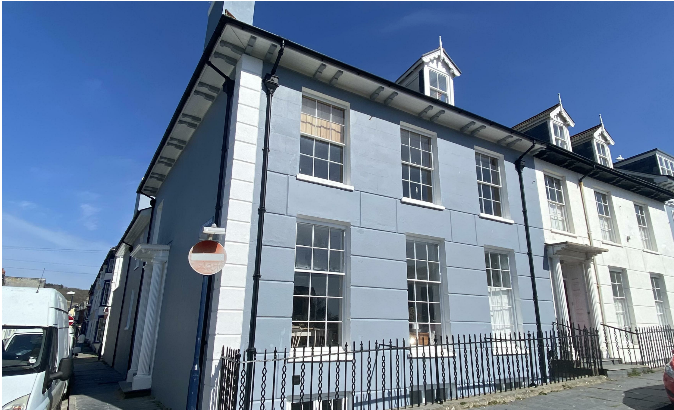
Flat 1, 7 Laura Place, Aberystwyth Ceredigion SY23 2AU Guide price £199,950