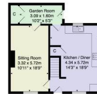
Ground Floor Total Area: 142.0 m 2 ... 1528 ft 2 All measurements are approximate and for display purposes only. No liability is accepted by either the agency or Box Property Solutions Ltd as to the exact measurements of the rooms. Box Property Solutions Ltd retains the copyright on this plan and allows agents to use it with agreed permission.

Sloping lawn with to front shared walkway leading to enclosed rear gardens with shaped lawn and timber shed. Hard-standing provides off-street parking.