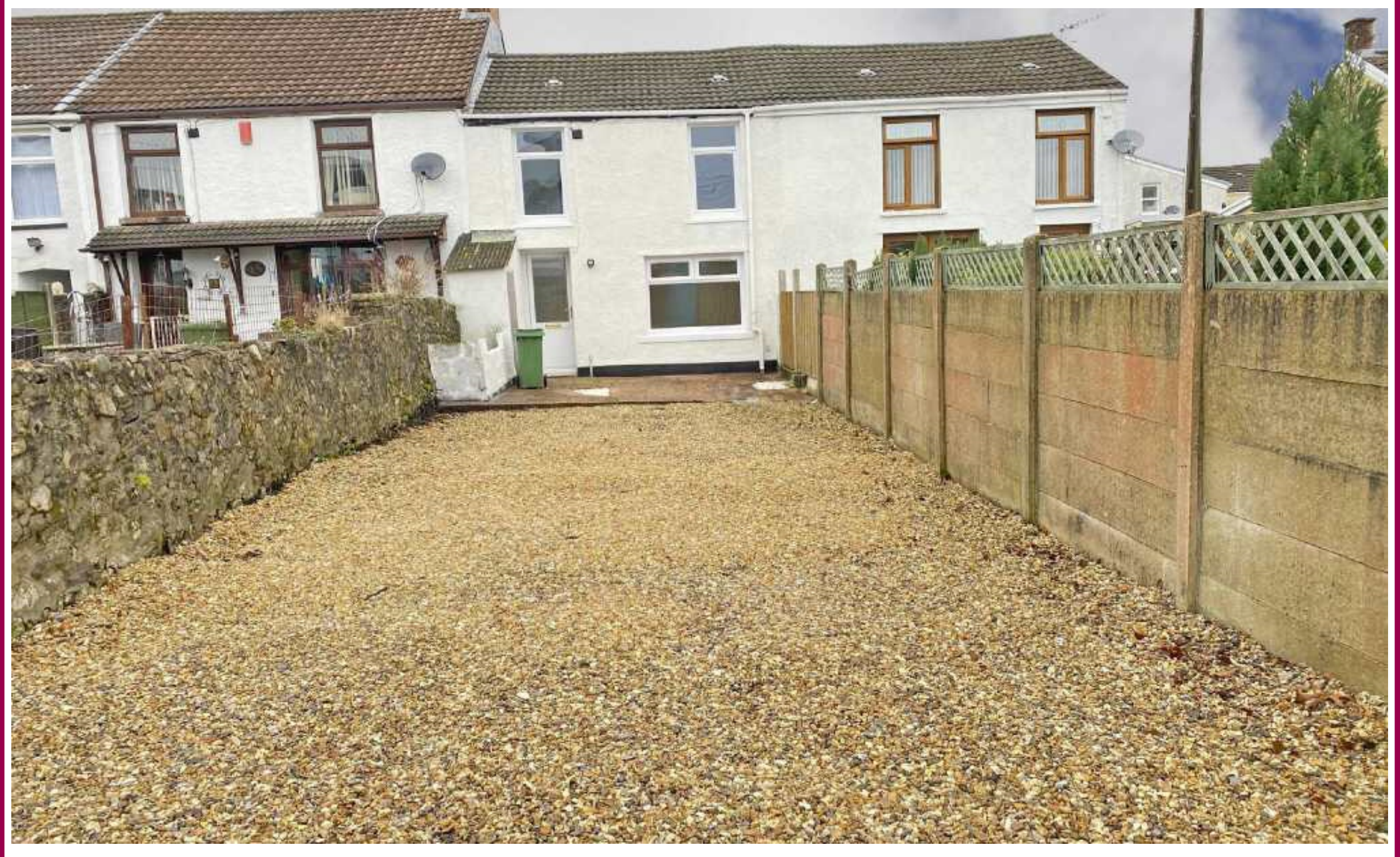
5 Mount Pleasant Street, CF44 8NF £144,995