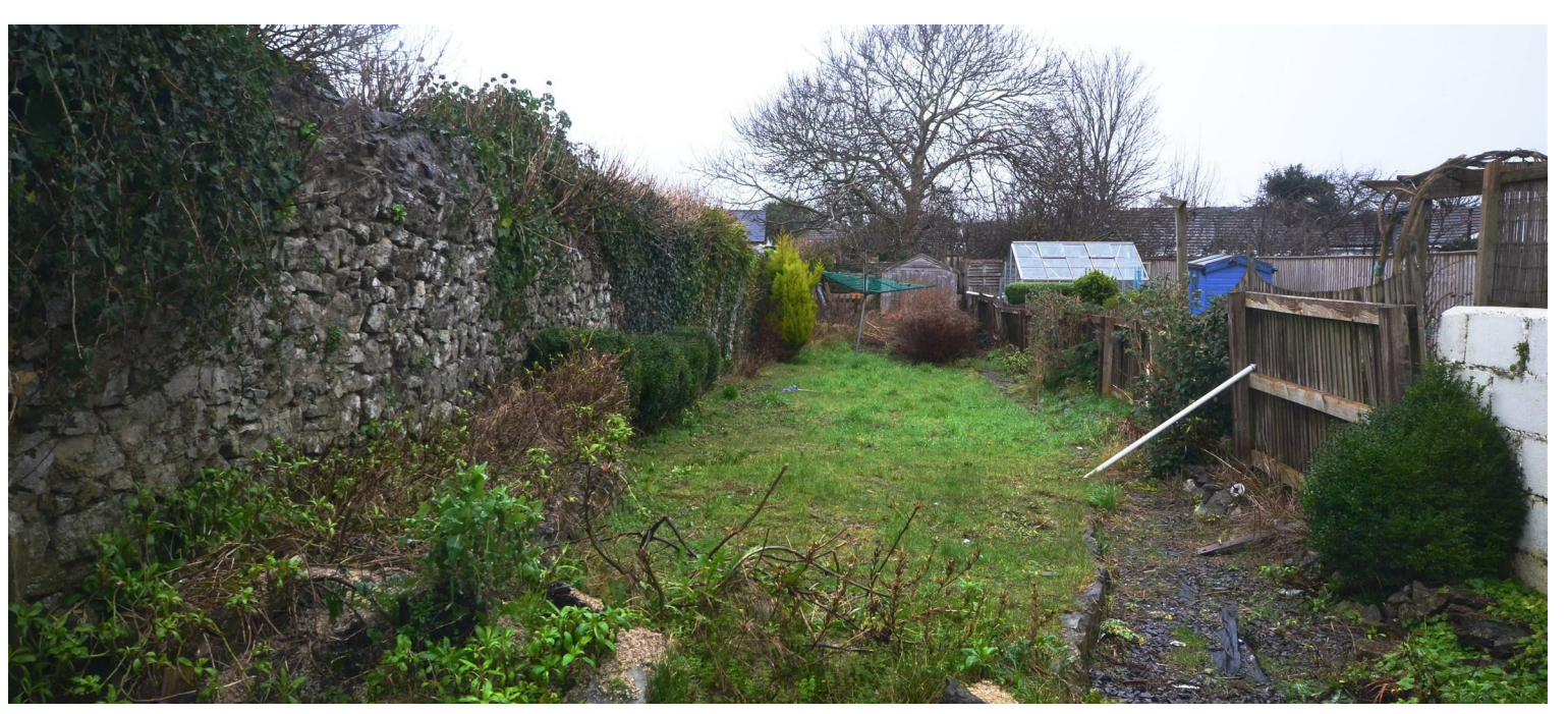
****VIRTUAL VIEWING AVAILABLE***

A well-presented end terraced house located in the popular area of Ropewalk Terrace in Pembroke, within walking distance of Pembroke town centre. The layout of the property briefly comprises entrance hall, kitchen, Shower Room, Lounge, two bedrooms, En suite shower room, and WC. Externally the property offers an enclosed garden to the rear.