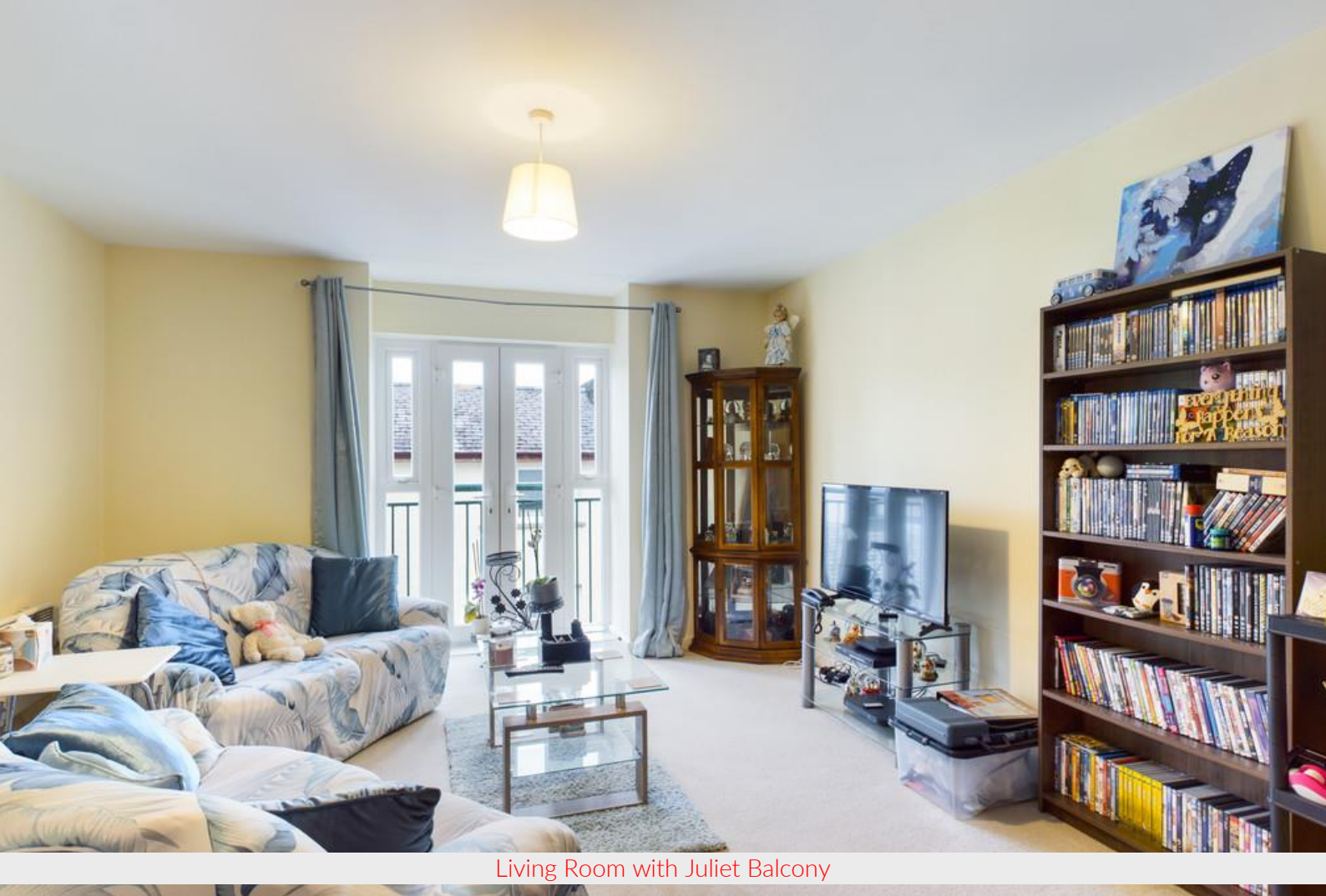
Living Room with Juliet Balcony

Location: From the Hackney & Leigh office head towards the town centre, turn right by The Card Factory into Entry Lane and Printers Croft is on the right above Pizza Express.