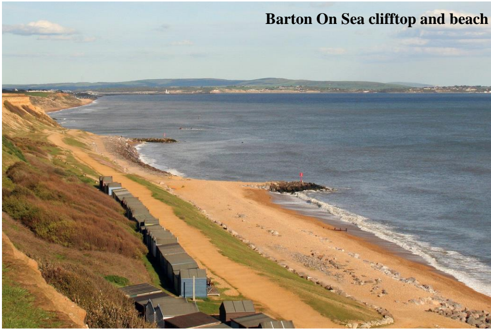
Barton On Sea clifftop and beach