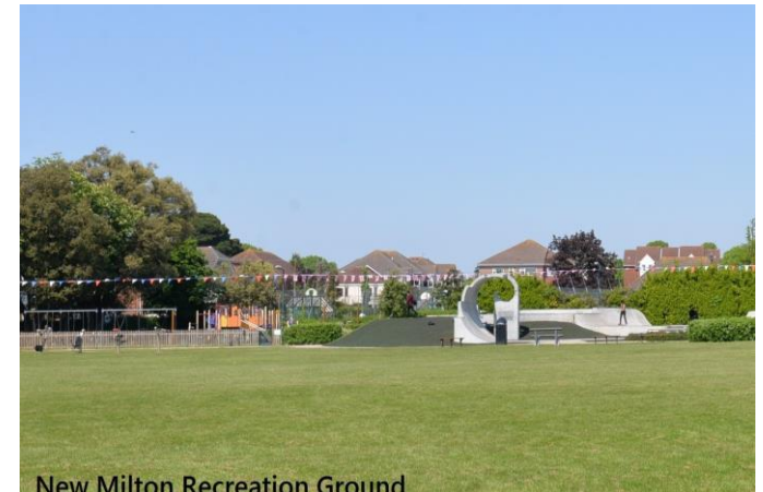
New Milton Recreation Ground