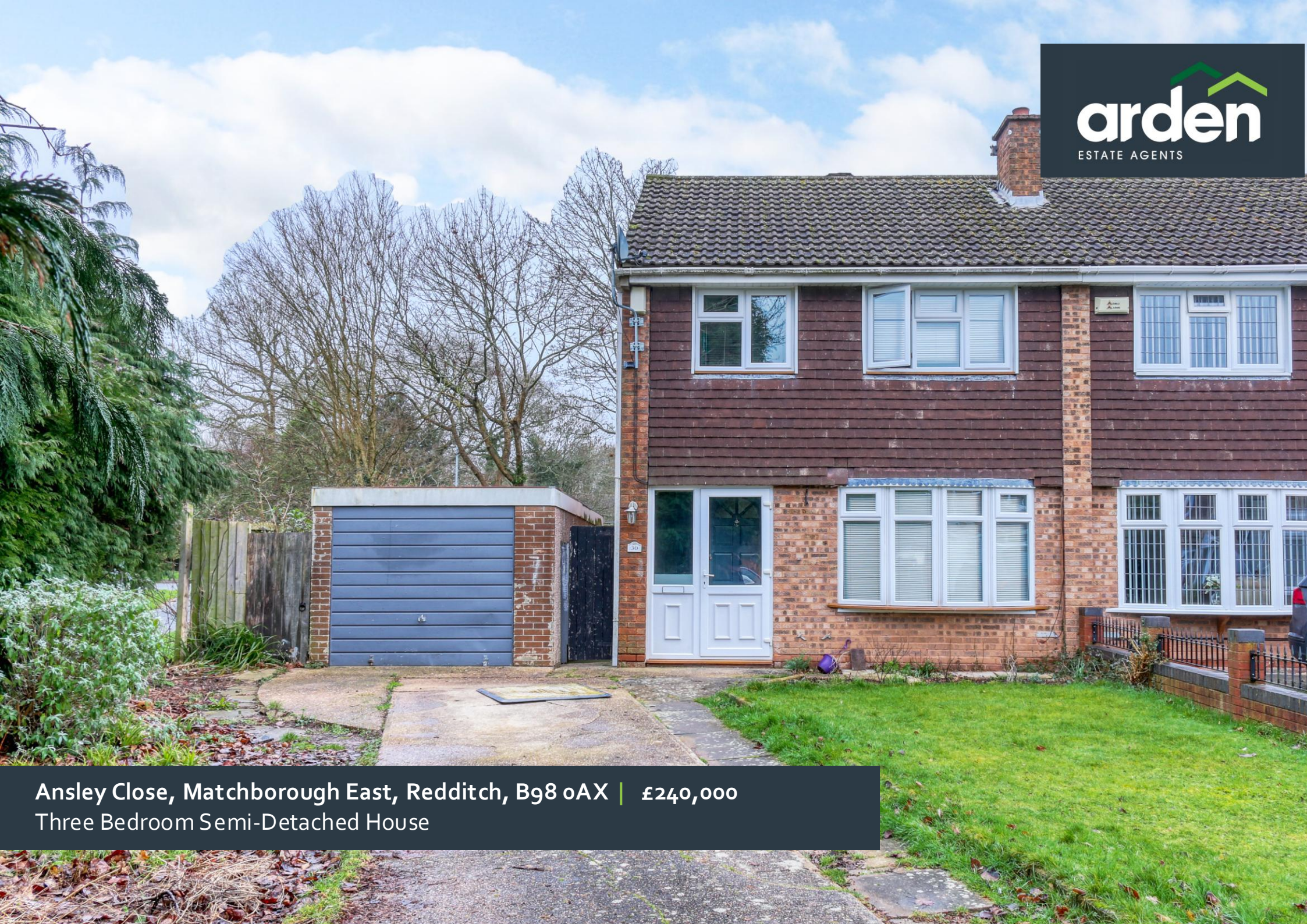
Ansley Close, Matchborough East, Redditch, B98 0AX | £240,000 Three Bedroom Semi-Detached House