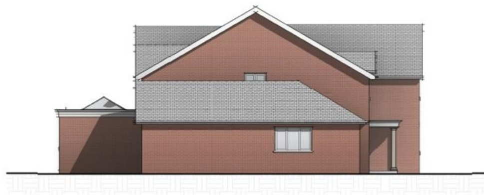
3 LEFT ELEVATION