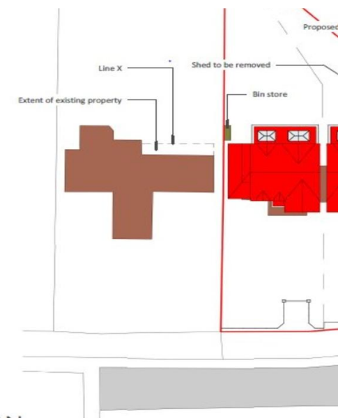
7 SITE PLAN